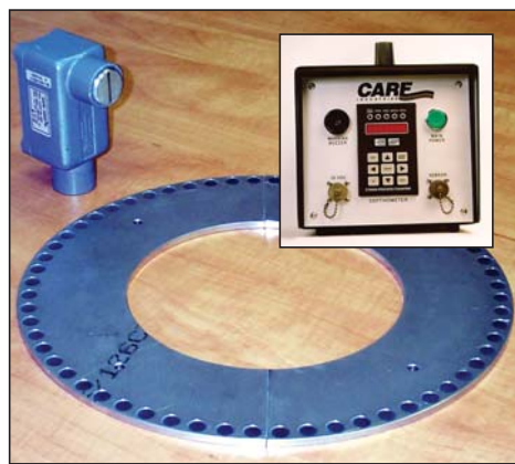
Down (the well) for the count: The mobile counter system (inset) runs off 12 Vdc from the CARE Industries truck (right). The sensor (above) also detects any rotational direction change.

For many years, the process of “swabbing” oil and gas wells has been a successful way to evaluate, test and restore a well back to usable production levels. These wells can have a depth of a few hundred meters to as much as 5000 m.