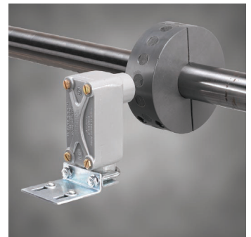
933XP Sensor and Pulser Wrap