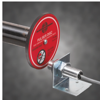
932 Sensor and Pulser Disc