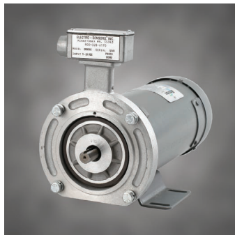
1102 Sensor in NEMA C Ring Kit