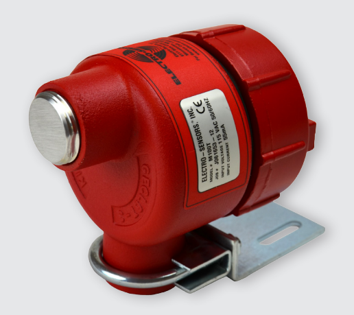
Figure 2: New style M100T/M5000T