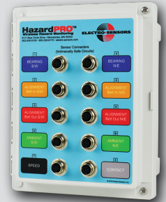
Class II Div. 1 Node