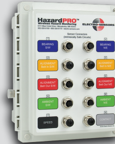
Class II Div. 2 Node