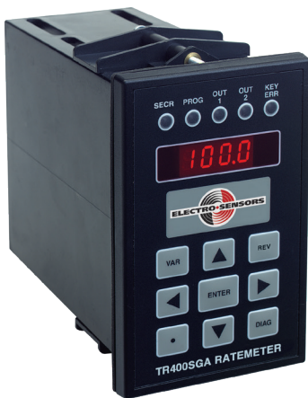
Optional PM500 Remote Display Unit

The optional PM500 Remote Display can provide +24 VDC power to the SG1000C, it can display the SG1000C's 4-20 mA signal (proportional to 0 through 359 degrees) in desired units, typically 0% to 100%. The PM500 also has two relays and a 4-20 mA proportional output.