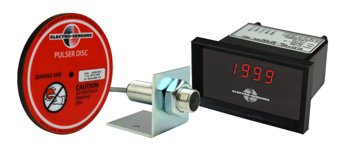
Standard System with: AP1000, 906 Speed Sensor, 255 Pulser Disc

A standard system includes the AP1000 tachometer, a shaft-end mounted pulser disc or split collar pulser wrap, and a Hall Effect Sensor. The pulser generates an alternating magnetic field that is picked up by the large gap, non-contact sensor, which transmits this signal as a digital pulse to the AP1000 via a 3-conductor shielded cable. The AP1000 translates this signal into Hertz or other desired programmable user units such as RPM, FPM, GPM, or TIP (Time-in-Process) and displays them on the front panel LEDs.