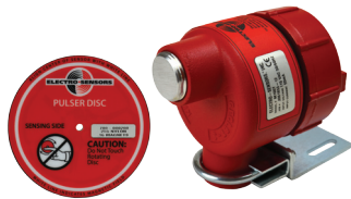
Example 2-Piece System

Many applications are more suited to having the switch electronics and sensor right at the monitoring point (a two piece system) – that way everything is calibrated right there. Other applications require the switch to be remotely mounted from the sensor and disc (a three piece system). Space limitations, environmental considerations, and personal preference all play a part in determining the speed switch system required – figure out what you need before installation begins – it will save you time and money in the long term.