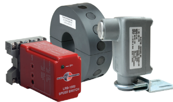
Example 3-Piece System