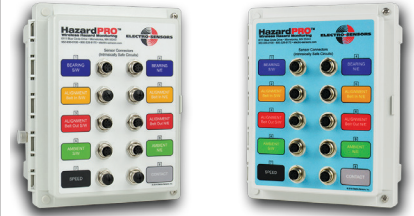
Class II Div. 2 Node Class II Div. 1 Node