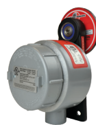
EZ-SCP Mounting Option