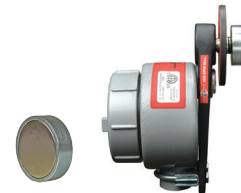
MM-2.00 Mounting Magnet Option (must be used with EZ-SCP)