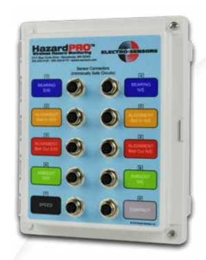
* Class II Div. 1 or Class II Div. 2 Models Available